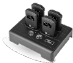
Auri D4 Docking Station 4