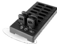
Auri D16 Docking Station 16