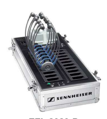
EZL 2020-D Charger/storage case 20 receivers and 2 transmitters