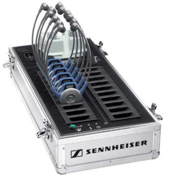
EZL 2020-D Charger/storage case 20 receivers and 2 transmitters