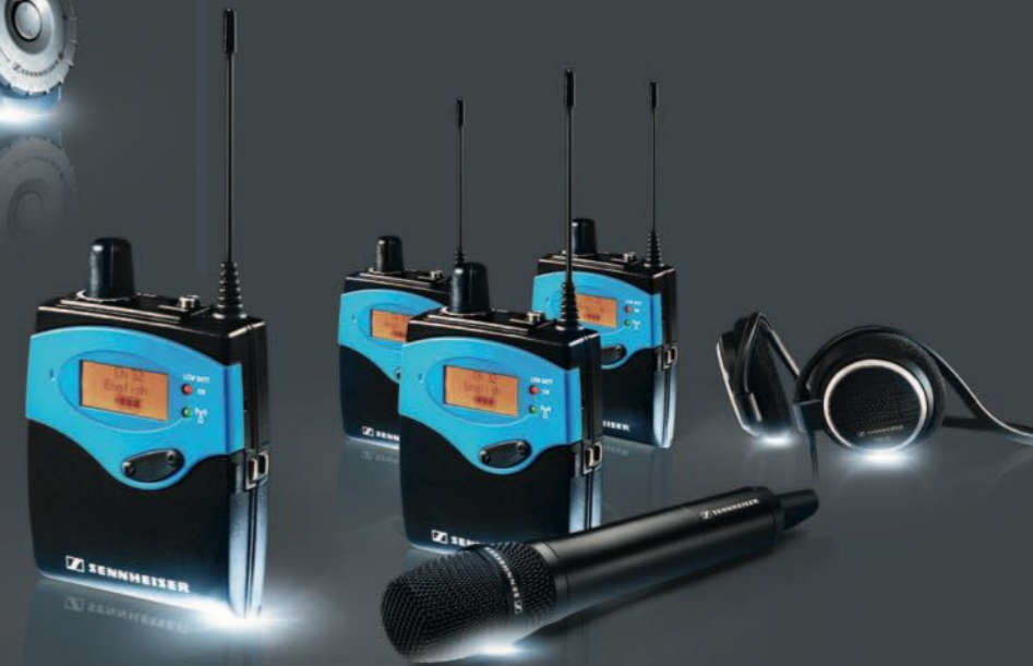
tourguide EK 1039